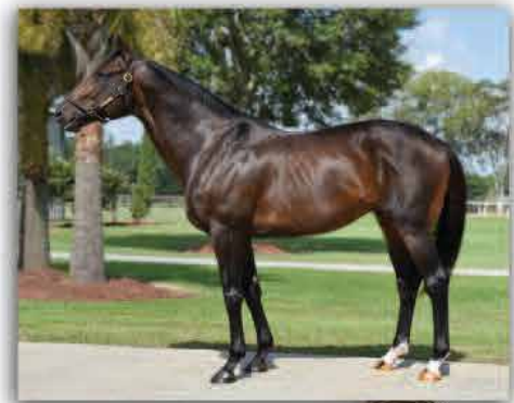
SUCCESS Mobile Bay