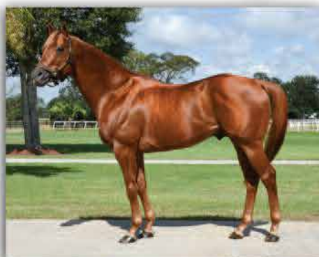
SUCCESS Mean Season