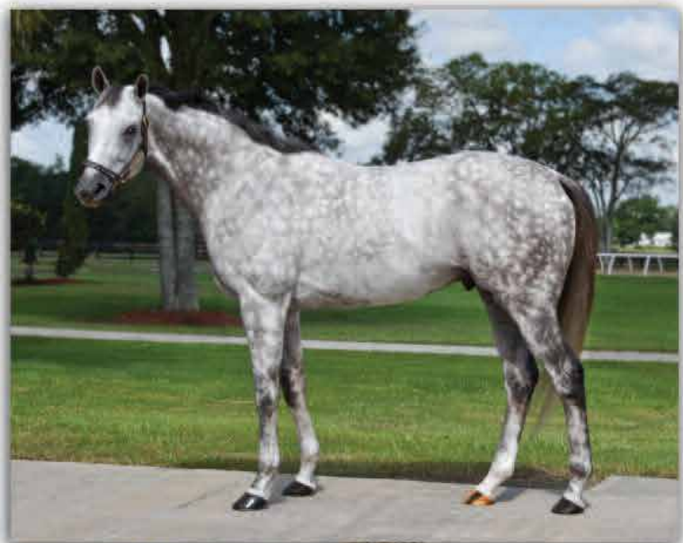
SUCCESS Iron Fist