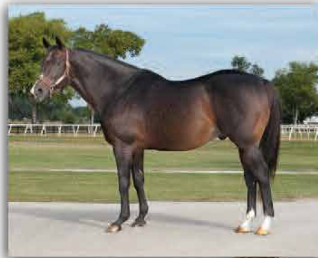
SUCCESS Run Production