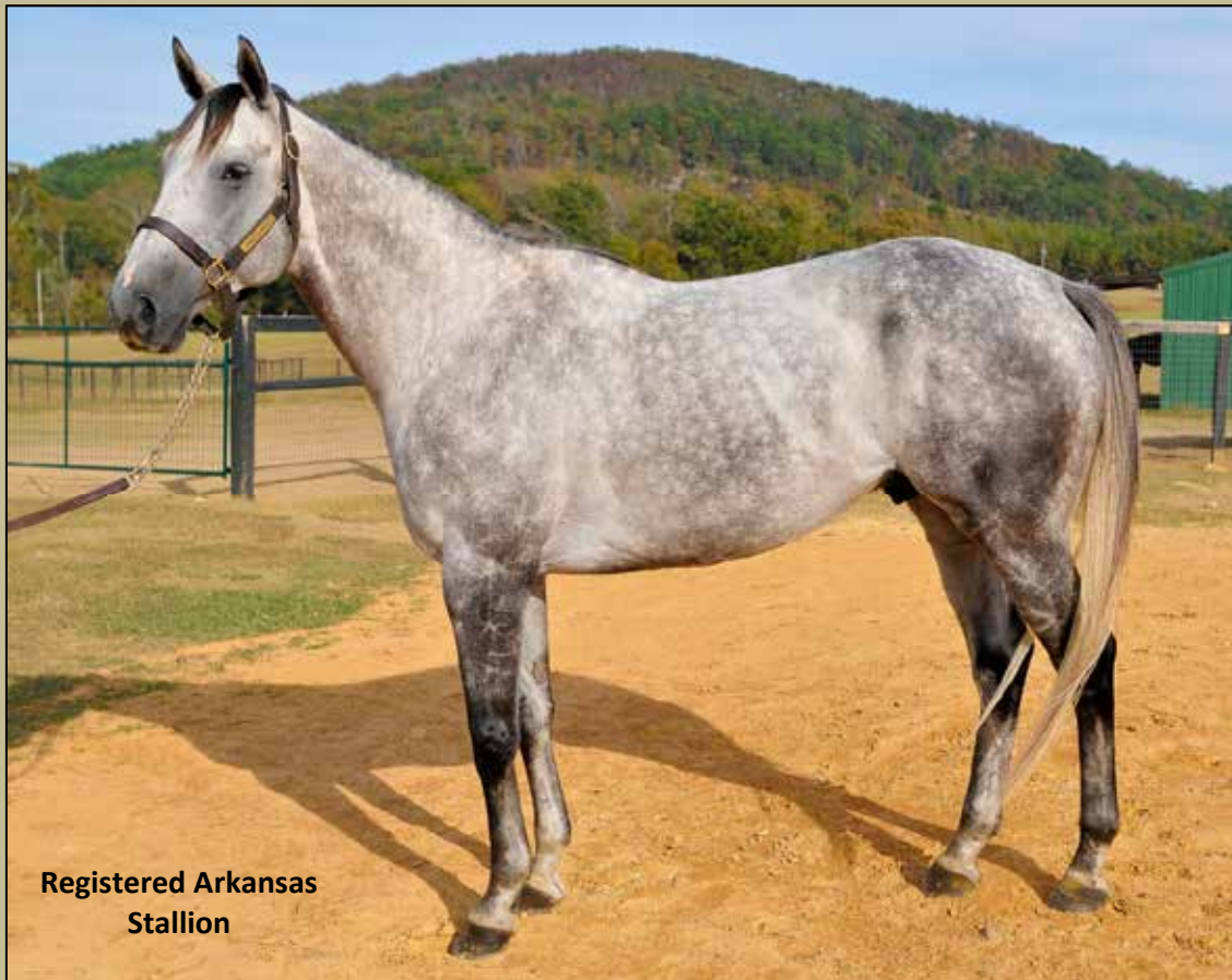
Registered Arkansas Stallion

Street Sense - Spoken Softly, by Notebook