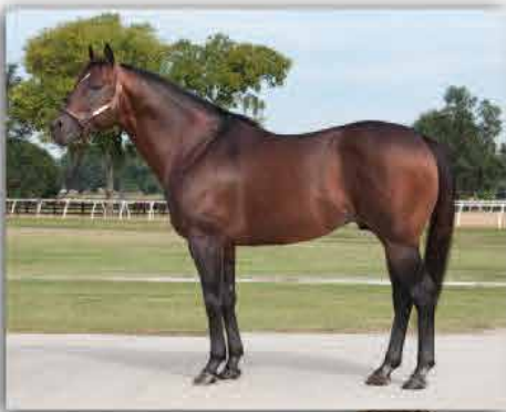
SUCCESS Closing Argument